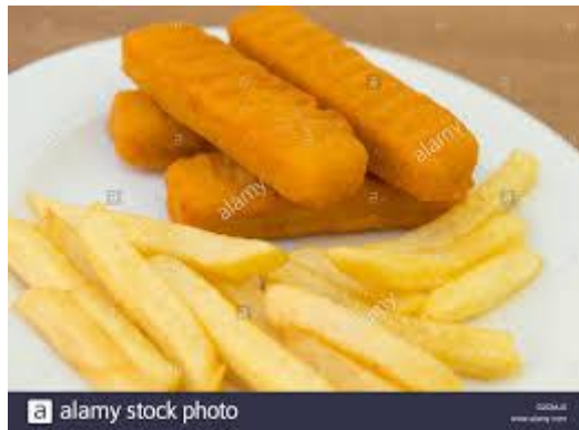
Breaded Cod Fish Fingers & Chips (FISH, GLUTEN)