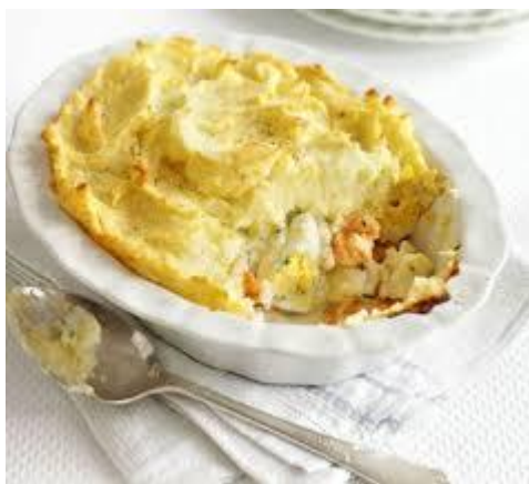
Fish Pie & Broccoli

Celery, gluten, milk, mustard, nuts, sesame seeds, peanuts