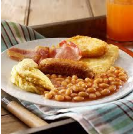
All Day Breakfast