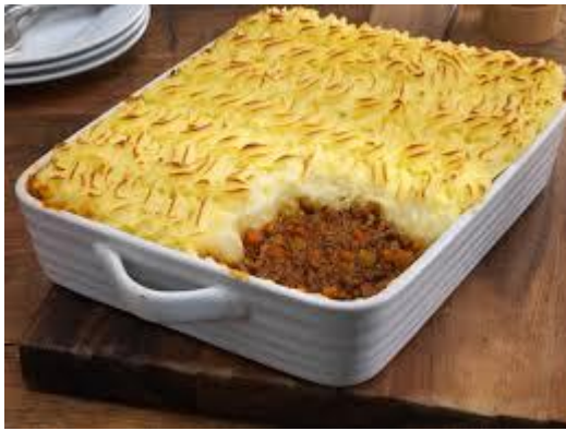
Cottage Pie & Baby Carrots