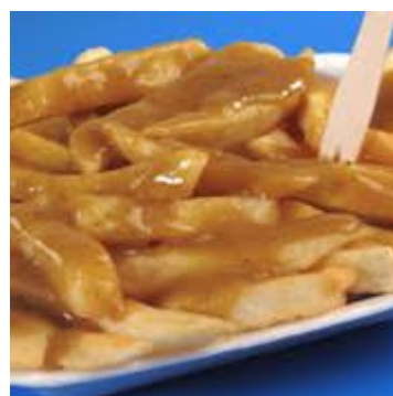
Curry Sauce & Chips (CELERY, EGG, MILK)