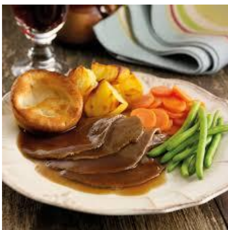
Roast Beef, Roast Potatoes, Mixed Vegetables & Yorkshire Pudding