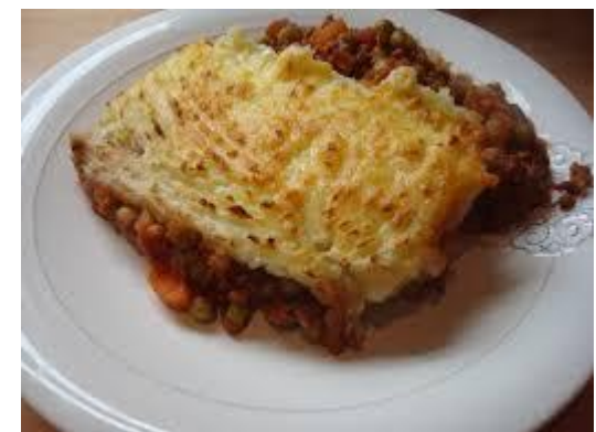
Quorn Cottage Pie & Peas