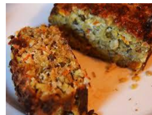
Nut Loaf, Roast Potatoes, Mixed Vegetables & Yorkshire Pudding

Gluten, milk, egg, celery, soybeans, nuts