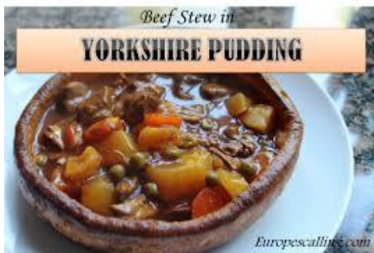
Beef Stew in Yorkshire Pudding