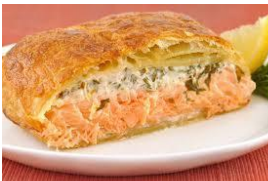
Salmon & Spinach en Croute, New Potatoes & Peas