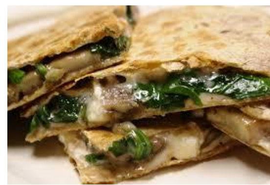
Spinach & Mushroom Quesadilla