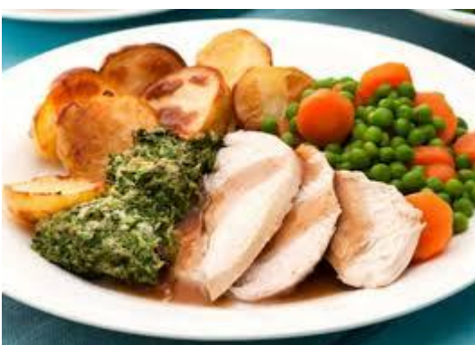
Roast Chicken, Roast Potatoes, Mixed Vegetables & Yorkshire Pudding