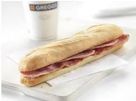
Bacon Baguette (GLUTEN)