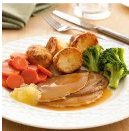
Roast Pork, Roast Potatoes, Mixed Vegetables & Yorkshire Pudding