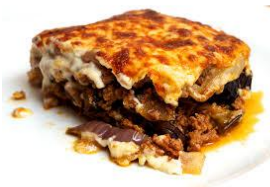
Lamb Mousakka & Side Salad