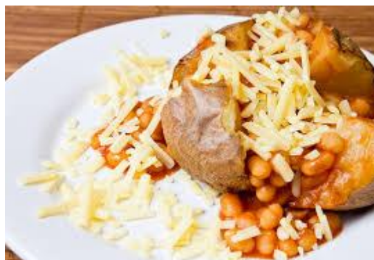
Jacket Potato, Cheese & Beans (or any Pasta Sauce) (MILK)