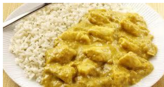
Chicken Korma, Rice & Naan