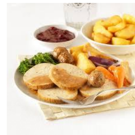
Quorn Roast, Roast Potatoes, Mixed Vegetables, Yorkshire Pudding