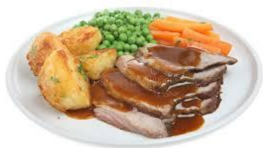
Roast Lamb, Roast Potatoes, Mixed Vegetable & Yorkshire Pudding