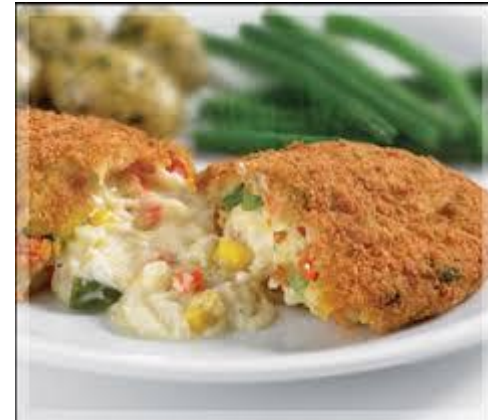
Vegetable Kiev, Mashed Potato & Runner Beans