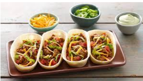
Beef Taco Boats