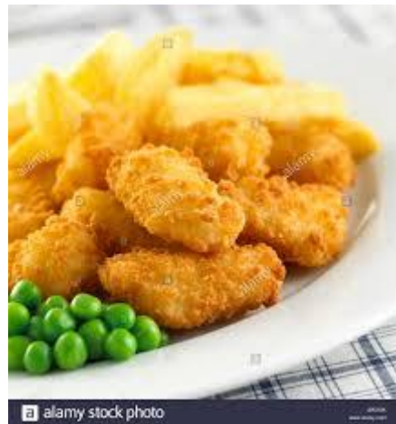
Breaded Scampi & Chips (CRUSTACEAN, GLUTEN)