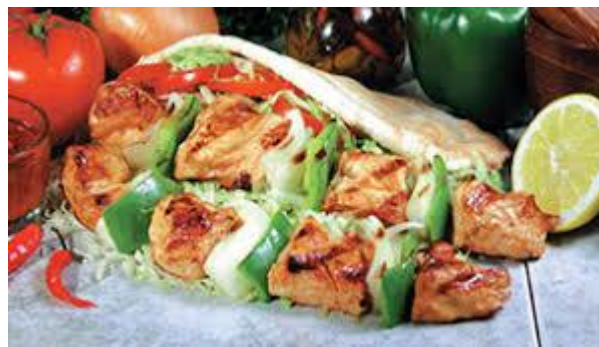
Honey Soy Chicken Kebab & Salad Filled Pitta