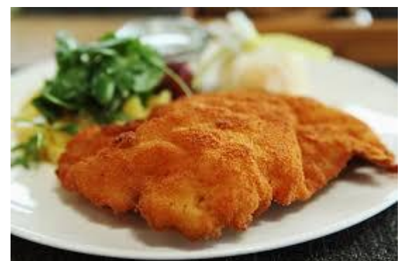
Southern Fried Escalope, Roast Potatoes, Mixed Vegetable & Yorkshire Pudding