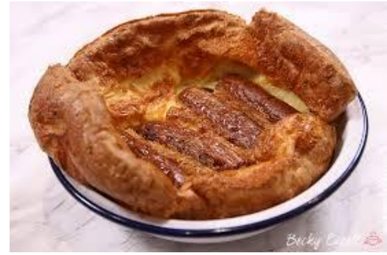
Quorn Toad in the Hole, Mashed Potato & Baby Carrots