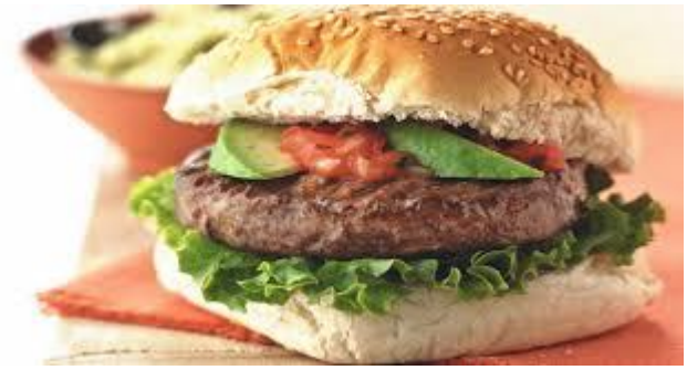
Fully Loaded Quorn Burger