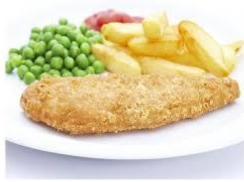
Breaded Cod Fillet & Chips (FISH, GLUTEN)