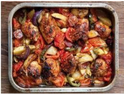
Spanish Chicken & Potato Rosti