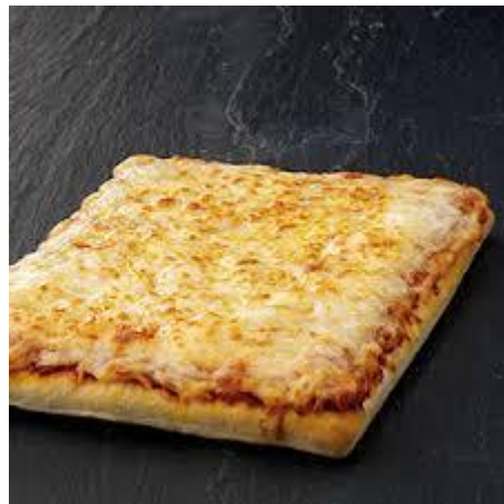
Cheese & Tomato Pizza, Wedges & Baked Beans (GLUTEN, MILK)