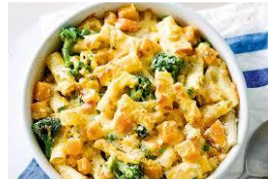
Broccoli Pasta Bake

Celery, gluten, milk, mustard, nuts, sesame seeds, peanuts