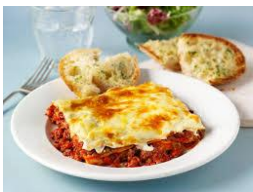
Beef Lasagne & Garlic Bread