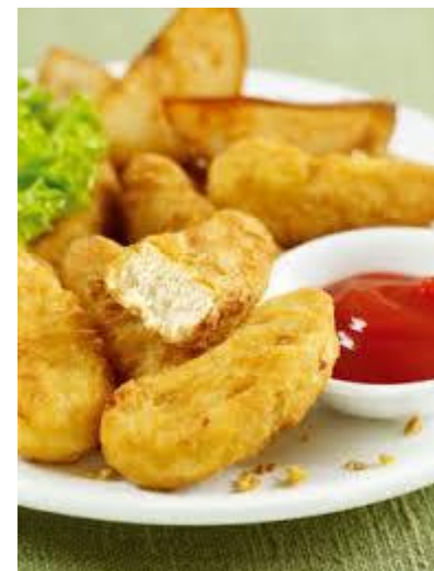
Quorn Dippers, Spicy Wedges & Peas