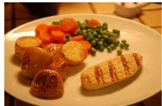
Quorn Fillet, Roast Potatoes, Mixed Vegetable & Yorkshire Pudding