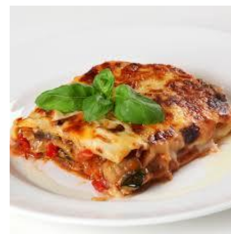
Vegetable Lasagne & Garlic Bread