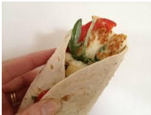
Southern Fried Chicken Wrap