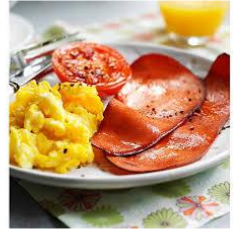
Vegetarian All Day Breakfast