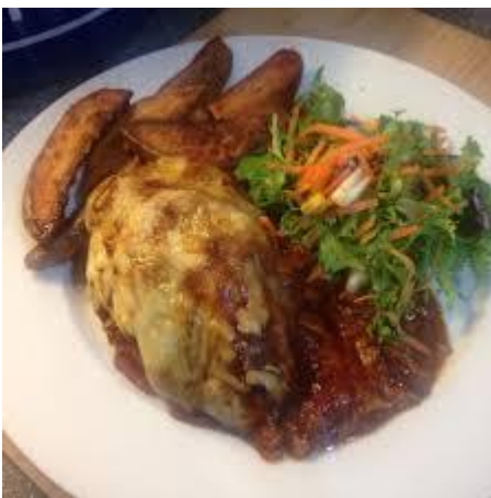
Hunters Chicken, Spicy Wedges & Peas