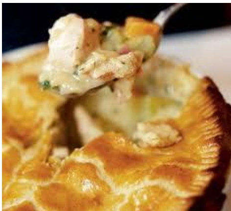
Chicken & Ham Pie, Mashed Potato & Runner Beans