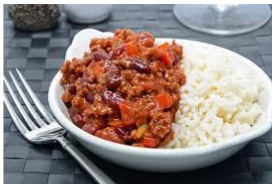
Chilli Con Carne & Rice