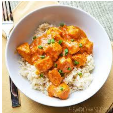
Chicken Tikka Masala, Rice & Naan Bread