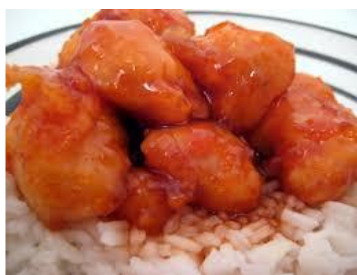
Sweet & Sour Battered Chicken & Rice